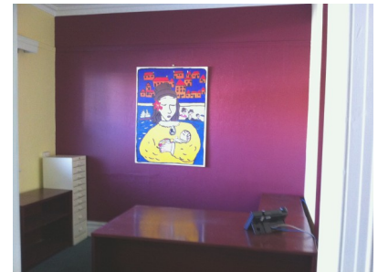
Caroline Chisholm, an inspiring social reformer, appears in our Reception at 12 Shuter Street.